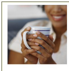
Green and black tea have beneficial effects on health.

Zinc Lozenges – these lozenges also have conflicting results according to research studies. However, the differing formulations that are produced may make research studies skewed as to the effectiveness. One